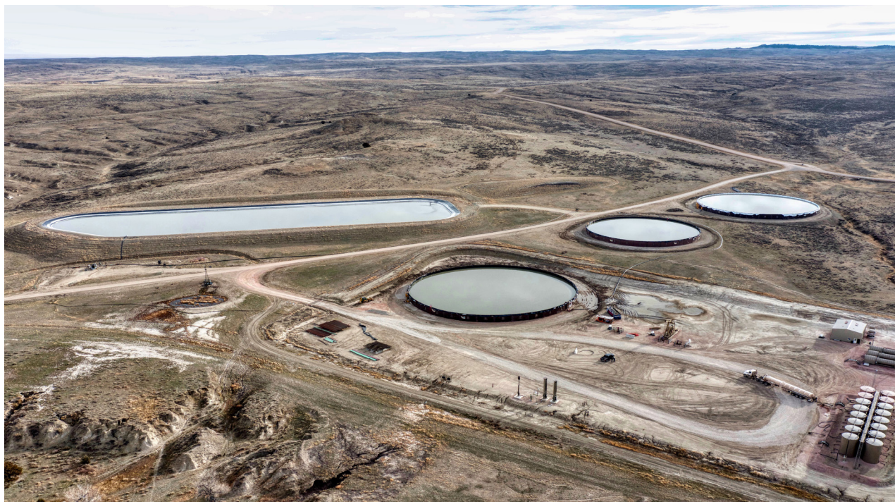
WATER TANKS AT A CUB CREEK PAD