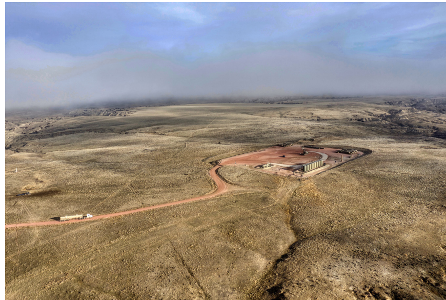
PRODUCTION FACILITIES IN WYOMING, USA

Current geopolitical developments underline the importance of Sangdong and Almonty Industries as a major independent source of tungsten in the Western world. Deutsche Rohstoff remains convinced of the metallurgical-geological quality of the Sangdong deposit and its economic potential.